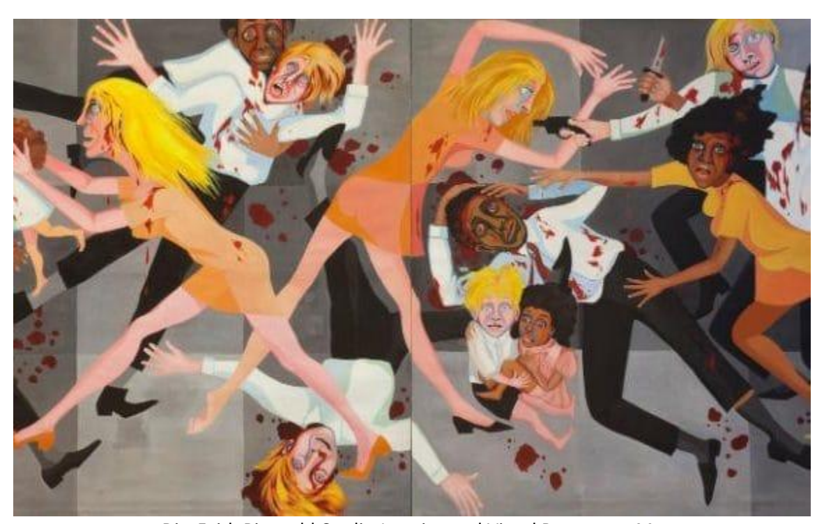
Die, Faith Ringgold

Where an earlier generation of African-American artists, such as abstract expressionist Norman Lewis, seen in the first room, were marginalised by an art world that was, the show argues, systemically racist, the new generation were determined to fight their way in "by all means necessary", to paraphrase one of the great buzz figures of the time Malcolm X.