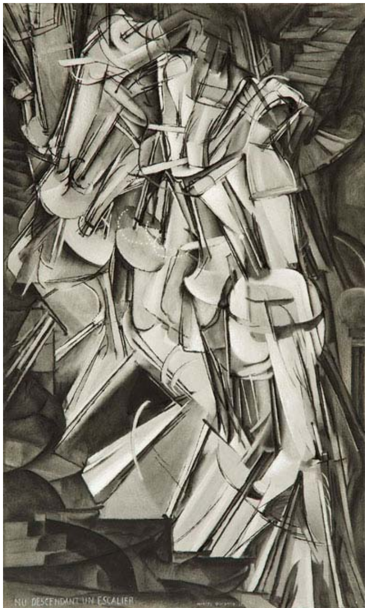
Marcel Duchamp's Nu Descendant un Escalier from 1915 bears close resemblance to the then-shocking version debuted at the Armory show in 1913.

It also makes me wonder if I'll see anything truly shocking at tomorrow morning's ABMB press preview. I tend to doubt it, partly because we have been treated to every sexual act, body part and social taboo-busting scenario in art in the years since Duchamp's Nude . But it's worth remembering that the scandal came from his formal daring, not from anything he actually depicted. With technology advancing so quickly on all fronts, our next big shock may yet again come from how an artwork delivers its message, as opposed to what's in it.