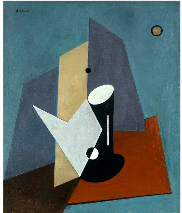
Untitled (Cubist Still Life with Telephone II), c. 1932, oil on canvas, 24" x 20", signed