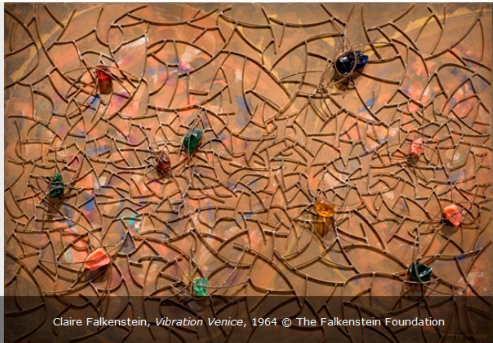
Claire Falkenstein, Vibration Venice , 1964 © The Falkenstein Foundation

The exhibition opens with early works of American Abstract Expressionism. The following room is dedicated to the painting of Polish-born American Jack Tworlov: a rich series of works on paper and five oil paintings documenting Tworlov's treatment of a female portrait in the stylistic and formal key of Abstract Expressionism. The narrative continues with the manifest impact of the American painting on Informal abstraction in Europe, with its prolific research into new pictorial mediums, gesture and the mark in the work of Italian artists such as Afro, Capogrossi, Santomaso and Vedova. Another gallery looks specifically at the work of Carlo Ciussi. A selection of works by postwar British artists—a little known aspect of Peggy's collection—documents the works of sculptors and painters of third quarter of the 20th century. Reminding us of Peggy's predilection for sculpture, this is followed by a series of works by Mirko Basaldella. Finally, the homage to Claire Falkenstein: one of the enduring memories of visitors to the Peggy Guggenheim Collection are of the metal and glass gates by this versatile American sculptor.