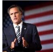
Mitt Still Doesn't Get It