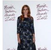
Princess Beatrice Looks Vaguely Normal in Erdem