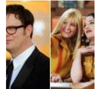
Rainn Wilson, '2 Broke Girls,' and the Rise of the Rape Joke