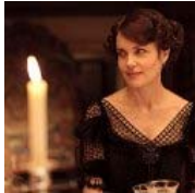
'Downton Abbey' Star Elizabeth McGovern on Season 3, 'Cheerful Weather for the Wedding,' and More