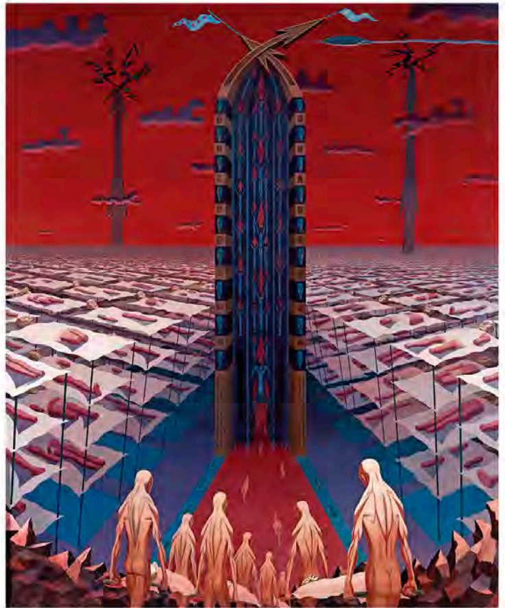
War Wounded , 1960, oil on canvas, 70 x 60 inches