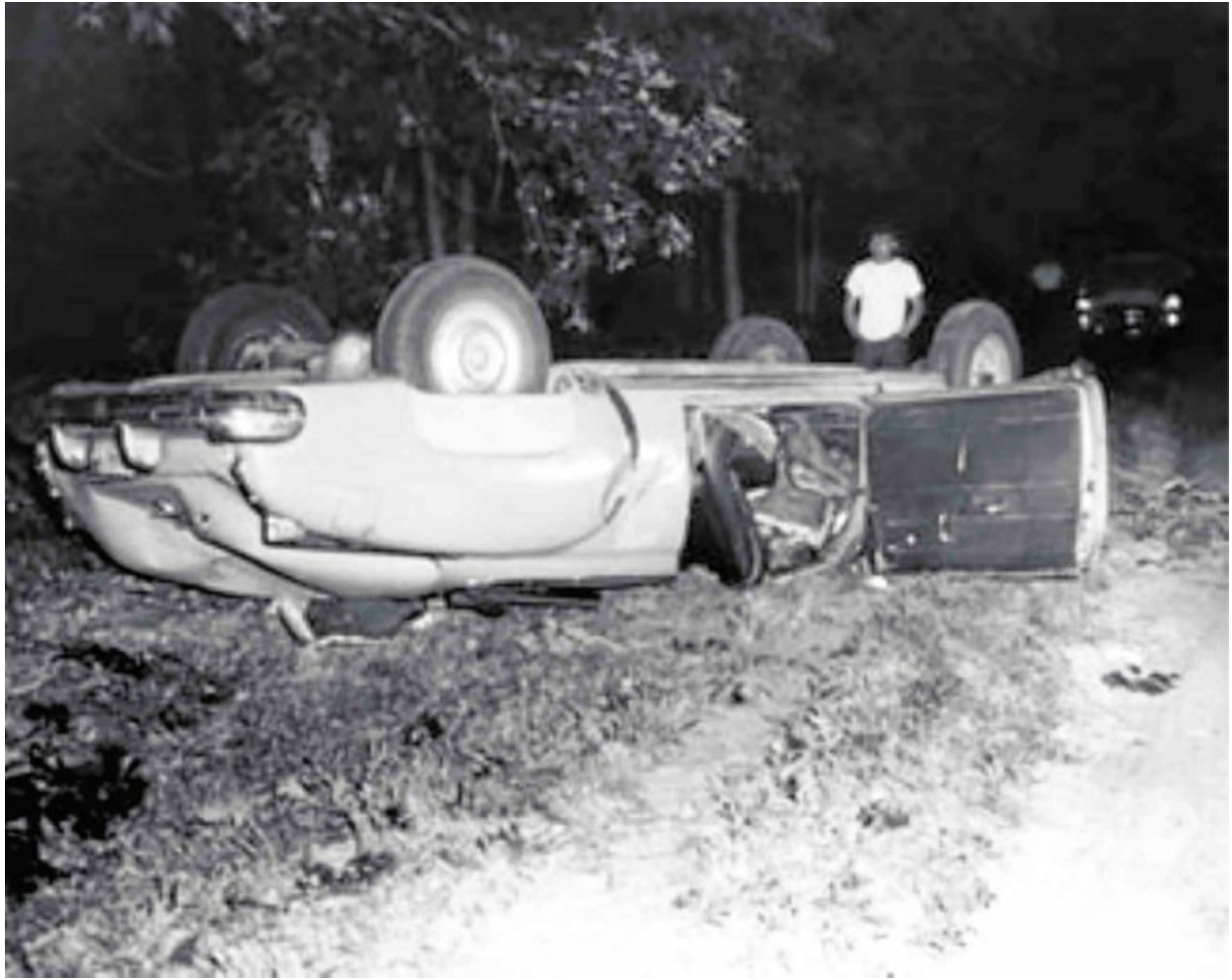
The car crash that killed Pollock on Aug. 11, 1957. The artist was driving to Ossorio's famous The Creeks estate in the Hamptons.

Pollock, in turn, influenced Ossorio in the latter's art practice, evident in "Cross-section/ Ascension."