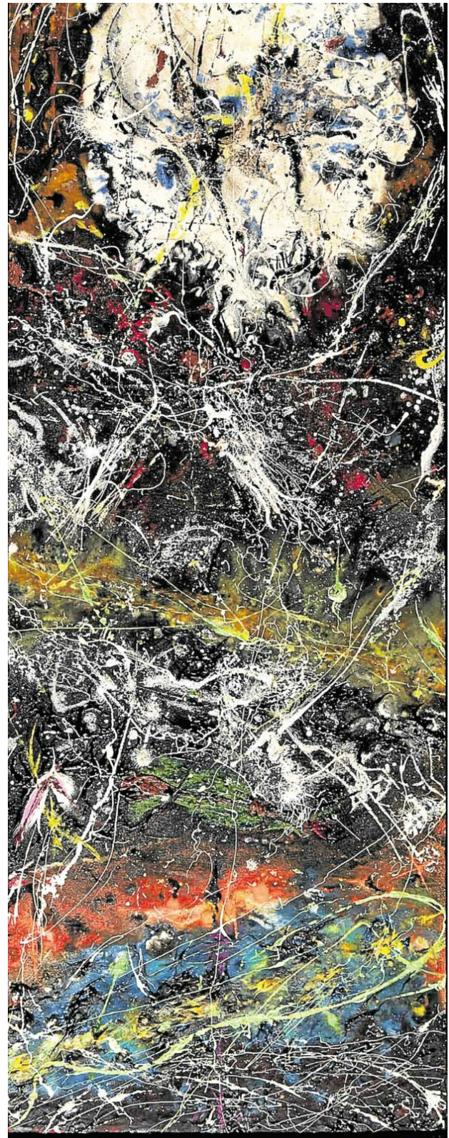
Hung vertically (244cmx 61 cm) and titled “Ascension”

Now particularly noted for the Catholic sensibility of his prolific oeuvre, Ossorio titled the work “Cross-section” before the crash and “Ascension” right after.