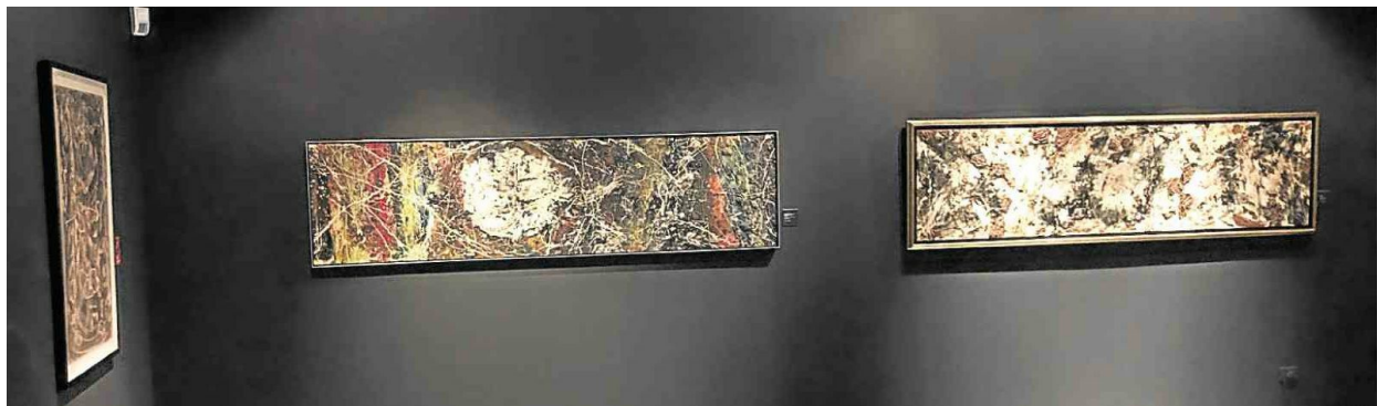
Ossorio's very rare panel series exhibited at Ayala Museum last February

Philippine Daily Inquirer / 05:02 AM August 20, 2018