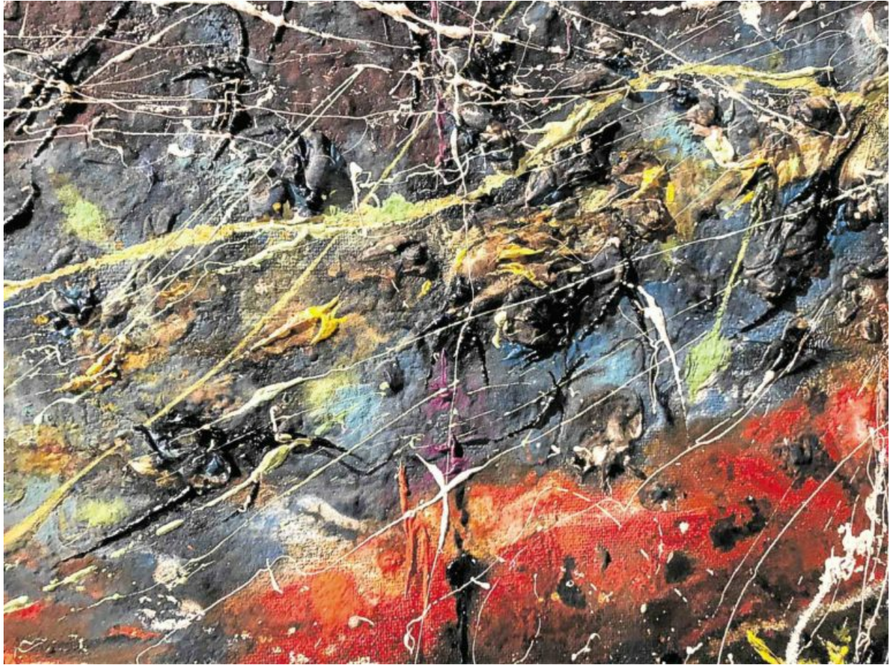
Hung horizontally (61 cmx 244 cm) and titled “Cross-section”

Whatever the real spirit impelling it, “Cross-section/ Ascension” is significant, said Ponce de León