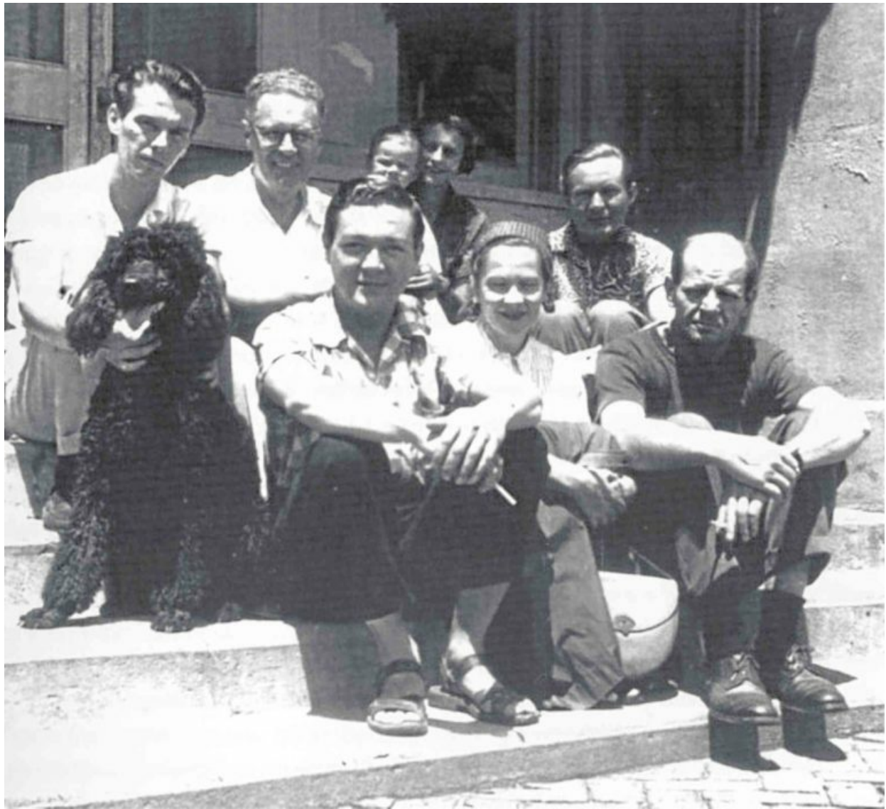
Alfonso Ossorio (center, foreground) and Jackson Pollock (front row, right)

Later in 1950 when Ossorio returned to the United States, he helped Pollock put up the now legendary exhibit at the Betty Parsons Gallery, where the only work that sold was “No. 1,” purchased by Ossorio himself for P1,500, and which is more known as “Lavender Mist.”