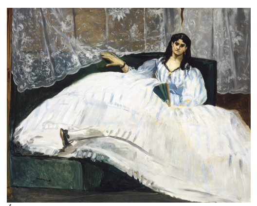
Édouard Manet, "Baudelaire's Mistress (Portrait of Jeanne Duval)" (1862), oil on canvas, 35 7/16 × 44 1/2 inches, Museum of Fine Arts (Szépművészeti Múzeum), Budapest

account of class, but not necessarily gender or race; he thus had much to say about the white woman in Manet's painting, but almost nothing about the black servant.