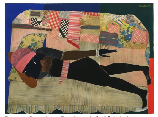
Romare Bearden, "Patchw ork Quilt" (1970), cut-and-pasted cloth and paper with synthetic polymer paint on composition board, 35 3/4 x 47 7/8 inches, The Museum of Modern Art, New York, Blanchette Hooker Rockefeller Fund, 1970, Art (© 2018 Romare Bearden Foundation/Licensed by VAGA at Artist's Rights Society (ARS), New York, NY)

And, in radical revisions of early modernist interpretations, Faith Ringgold's "Matisse's Model (The French Collection, Part 1: #5)" (1991) shows Matisse, a black odalisque, and in the decorative background, an image of Matisse's "The Dance" (1910); Ellen Gallagher's "Odalisque (Self-Portrait with Freud as Matisse)" (2013) is a slide projection with Freud as the artist drawing a clothed Gallagher; and Mickalene Thomas's "Marie: Nude black woman lying on a couch)" (2012) sets the black model in a contemporary interior filled with decorative fabrics. Finally, in Awoi Erizku's "Elsa "(2013), a large color photograph of a sex worker, we return to Manet's original conception, but now with a nude black woman alone in a spare room.