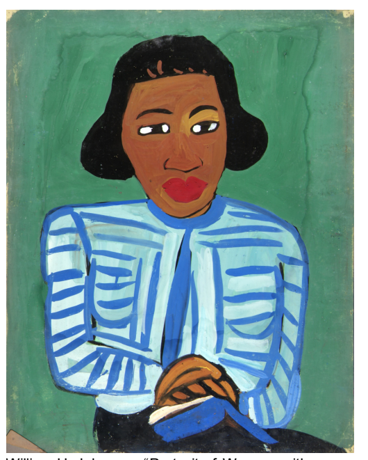
William H. Johnson, "Portrait of Woman w ith Blue and White Striped Blouse" (ca. 1940– 42), tempera on paperboard, 28 × 22 1/16 inches, Smithsonian American Art Museum, Washington, DC, gift of the Harmon Foundation

As its title indicates, Posing Modernity: The Black Model from Manet and Matisse to Today at the Miriam and Ira D. Wallach Art Gallery of Columbia University, presents a three-stage narrative of modernity, beginning with Édouard Manet's "Olympia" (1865, not on view here), which famously shows a white woman accompanied by a black servant; on to works of Henri Matisse depicting black models; and, more recently, images of black women by a number of African-American female and male artists, some of them redoing "Olympia."