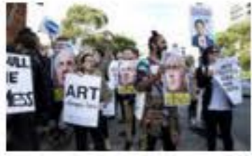
Australian Arts Community Campaigns Against Federal Budget Cuts