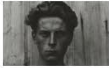
An Intimate Encounter with Paul Strand's Photographic Journeys