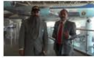
The Yes Men Launch Parody NRA Site to Donate Guns to "Less Fortunate" Americans [UPDATED]