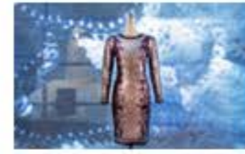
The Evolution of Dressmaking, from Hand- to Machine-Made