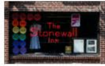
President Obama Declares Stonewall Inn First National Monument to LGBTQ History