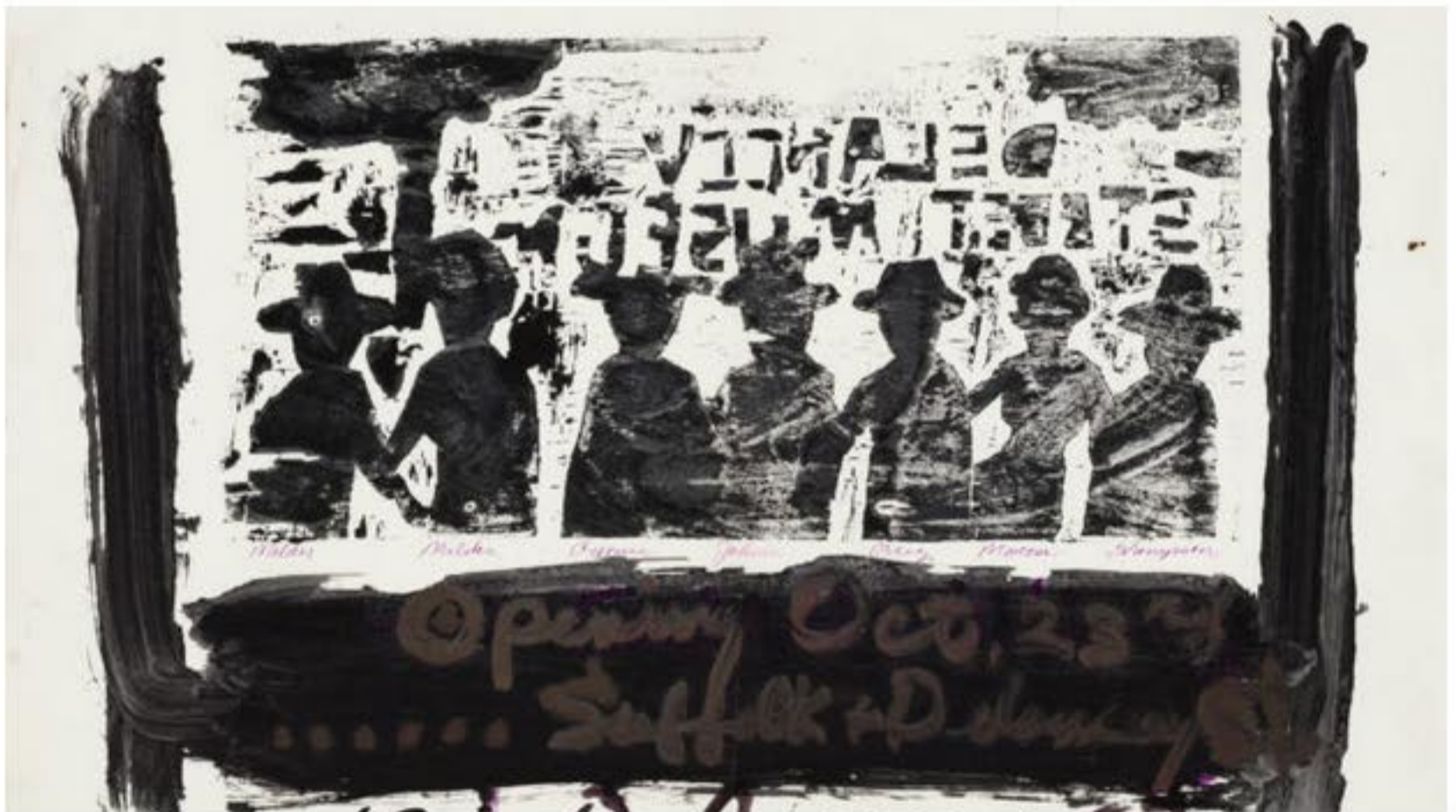
Detail: Bob Thompson, "Announcement for opening at Delancey Street Museum," 1959. Ink on paper, 22 x 34 in. Estate of Bob Thompson

When I arrived in New York City after college, I moved into a tiny, one-bedroom apartment at Seventeenth Street and Third Avenue. It had a fire escape that was perfect for the burglar who climbed up it a few months later. Since I worked at Esquire then, uptown on Madison Avenue, I described my new home to friends as a cozy, downtown abode, walking distance from Greenwich Village.