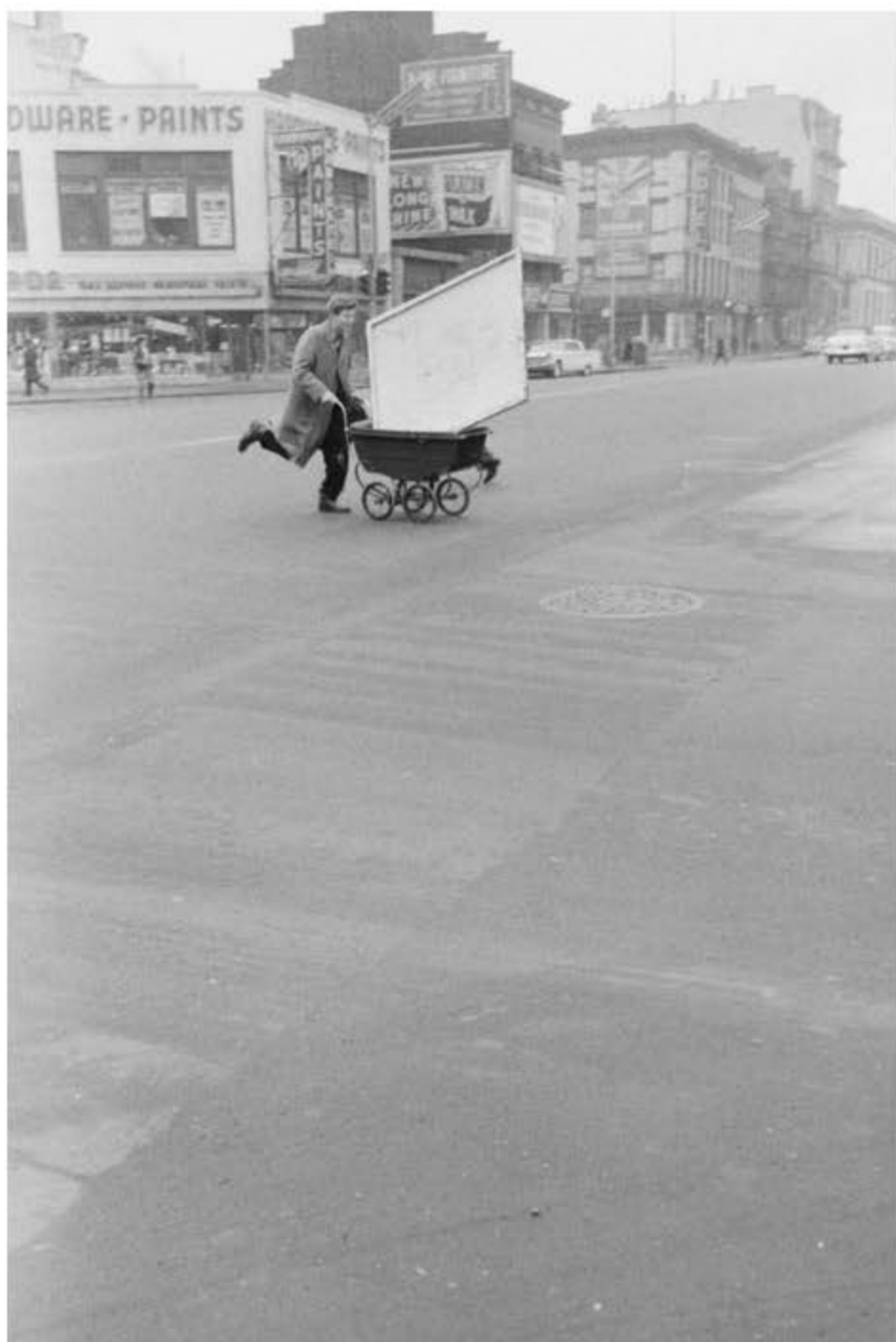
John Cohen, Red Grooms transporting artwork to the Reuben Gallery, 1960. Gelatin silver print, 10 x 6 3/4 in.