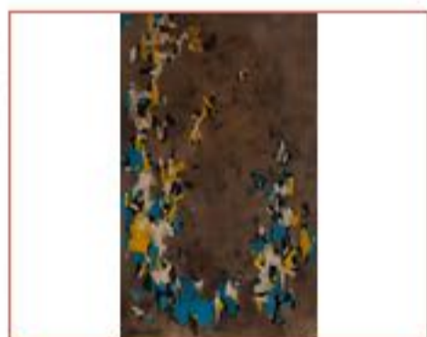
Norman Lewis, Untitled , 1965. Oil on canvas, 62 x 37 in.