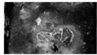
The Glass Door By Max Ritvo

REVIEW ARTS & CULTURE HISTORY USA February 9, 2017