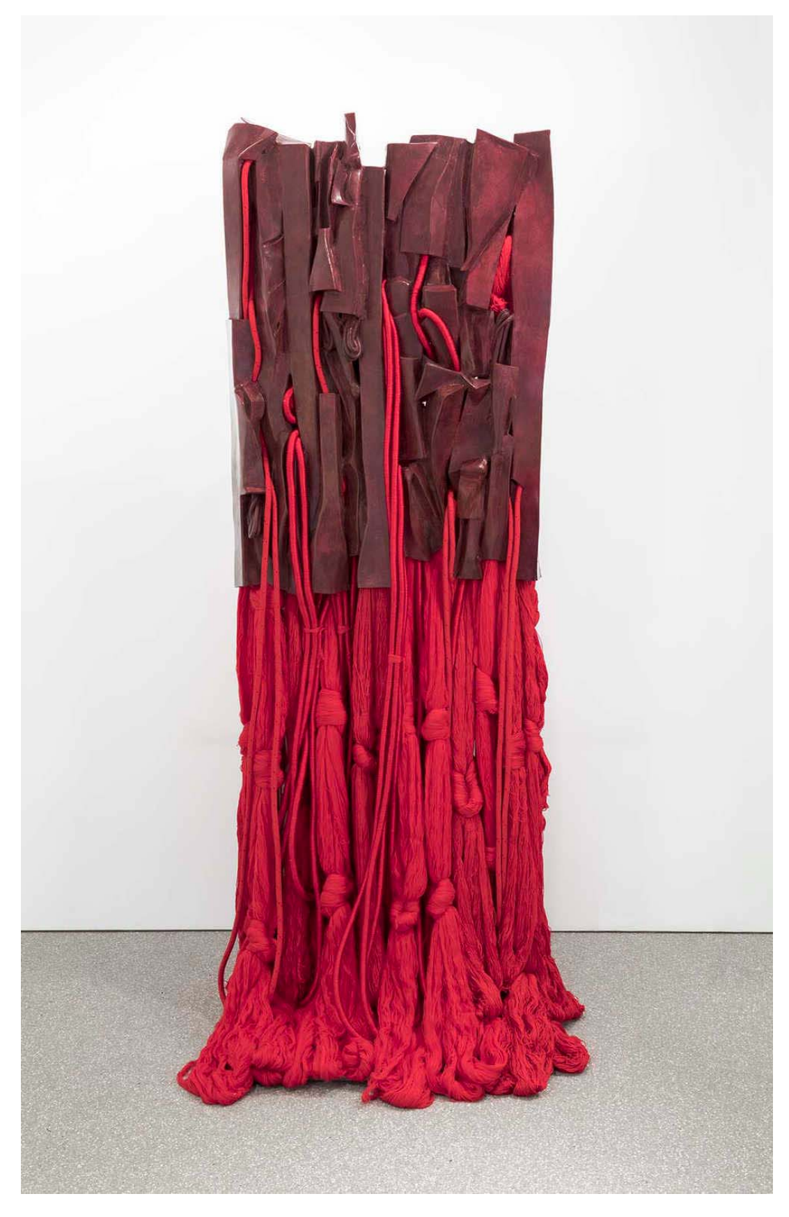
9. NEW YORK, Michael Rosenfeld Gallery Barbara Chase-Riboud: Malcolm X: Complete a series of monumental bronze and fibre sculptures, created over the last fifty years, in honour of the slain human rights leader open 10am-6pm Tue-Sat read more more exhibitions in New York