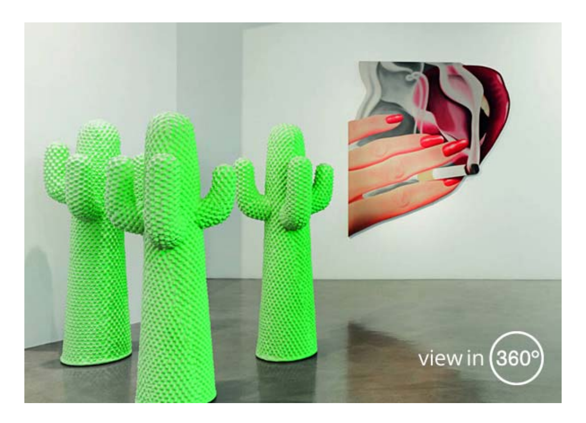
2. LONDON, Ordovas

Marilyn, Flowers, Lips, Gun, Mirror, Cactus