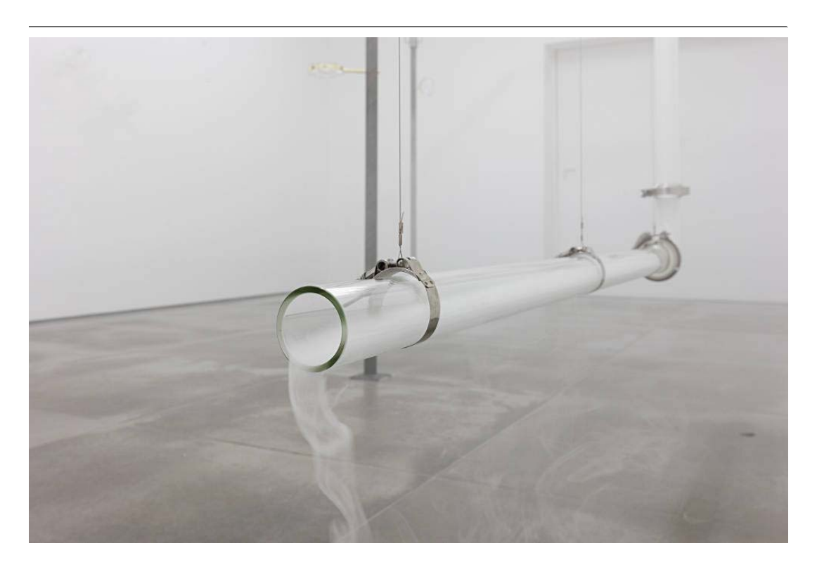
7. RIO DE JANEIRO, Galeria Nara Roesler