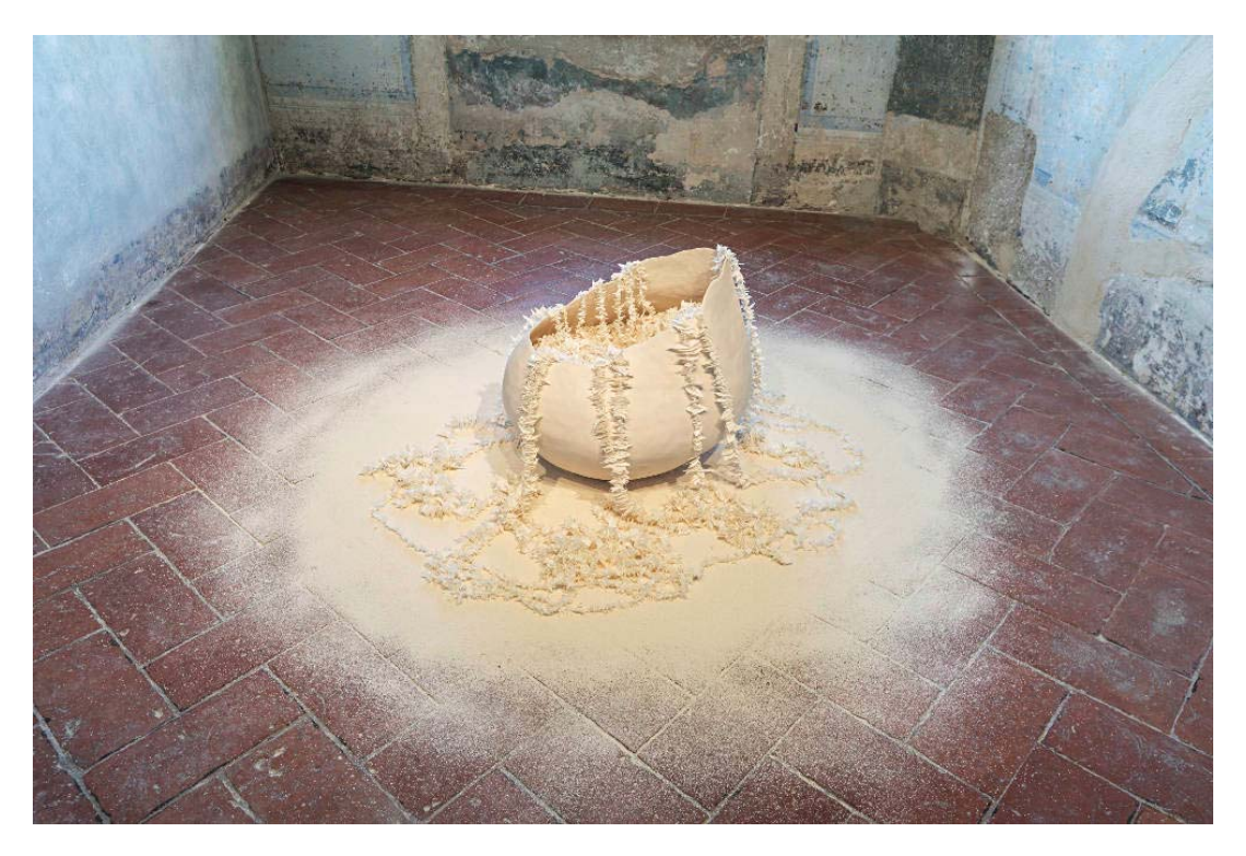
5. SIENA, Galleria Continua San Gimignano Sabrina Mezzaqui: Autobiografia del rosso new works inspired by a range of literary texts, stories and poems made from simple materials such as paper, fabric, thread and beads open 10am-1pm & 2-7pm Mon-Sun read more more exhibitions in Italy