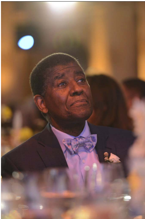
Skowhegan recognized artist William T. Williams for envisioning the Studio Museum in Harlem's prestigious artist-in-residence program.

More than 500 people attended the fundraiser, which brought in more than $900,000—a record according to Skowhegan. The funds raised help offset the cost of attendance for artists participating in the residency program.