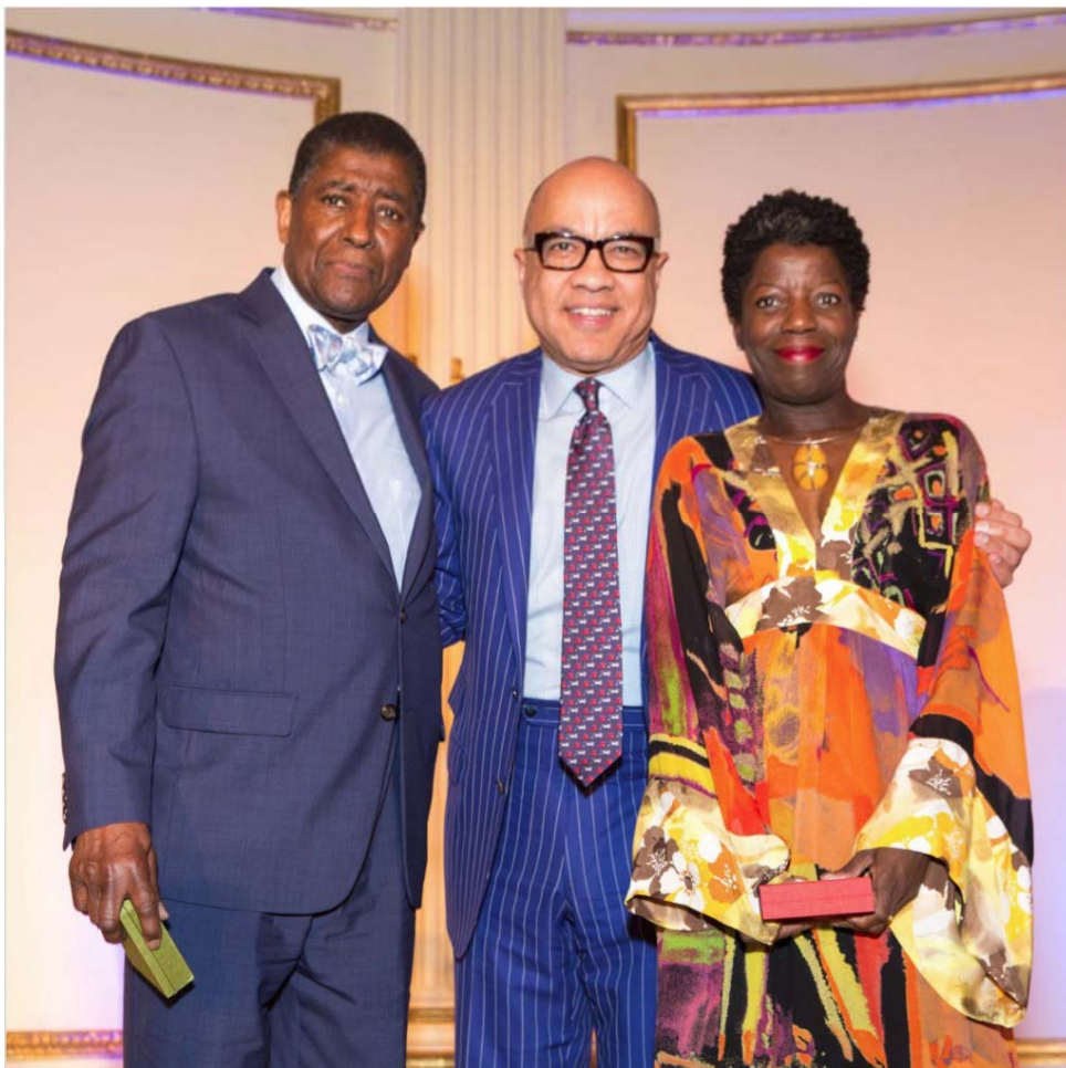
Ford Foundation President Darren Walker (center) presented a Skowhegan award honoring the Studio Museum in