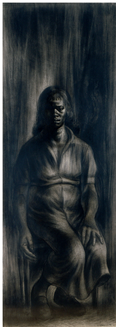
Let The Light Enter , 1961, charcoal and Wolff crayon on paper, 55 3/4" x 19 3/4", signed

From 1939 to 1940, White worked on Five Great American Negroes , a five-by-twelve-foot canvas depicting Sojourner Truth, Booker T. Washington, Frederick Douglass, Marian Anderson, and George Washington Carver. During these years, he was also commissioned by the Associated Negro Press to create A History of the Negro Press , and three of his artworks were included in the Library of Congress exhibition The Art of the American Negro . While in the WPA, White also met and befriended photographer Gordon Parks, and the two of them would often walk through Chicago's South Side together, photographing and sketching the biography of the neighborhood.