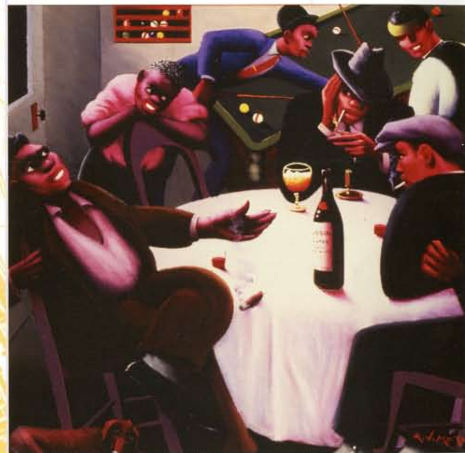
The Liar (1936). Howard University Gallery of Art, Washington, DC.

A RCHIBALD MOTLEY (1891–1981) WAS BORN IN NEW ORLEANS and lived and painted in Chicago most of his life. But because his subject was African-American life, he's counted by scholars among the artists of the Harlem Renaissance.