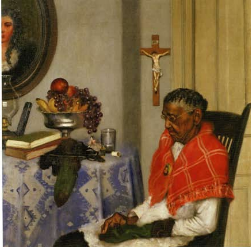
Mending Socks (1924) Burton Emmett Collection, Aklant Art Museum, University of North Carolina at Chapel Hill

Duke University received a $120,000 grant to support a traveling exhibition of "Archibald Motley: Jazz Age Modernist," which, after the show closes at the Nasher Museum of Art, will be on display at the Amon Carter Museum of American Art in Fort Worth, Texas, from June 14 to September 7, 2014; the Los Angeles Museum of American Art from October 19, 2014, to February 1, 2015; the Chicago Cultural Center from March 6 to Aug. 31, 2015; and the Whitney Museum of American Art in New York City in the fall of 2015.