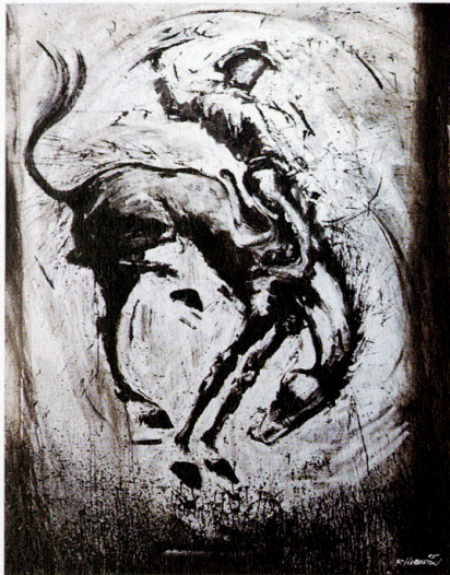
HORSE AND RIDER, 2005