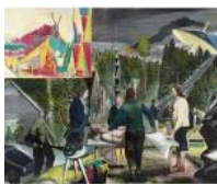
Neo Rauch at David Zwirner, through Dec. 20 533 W. 19th Street