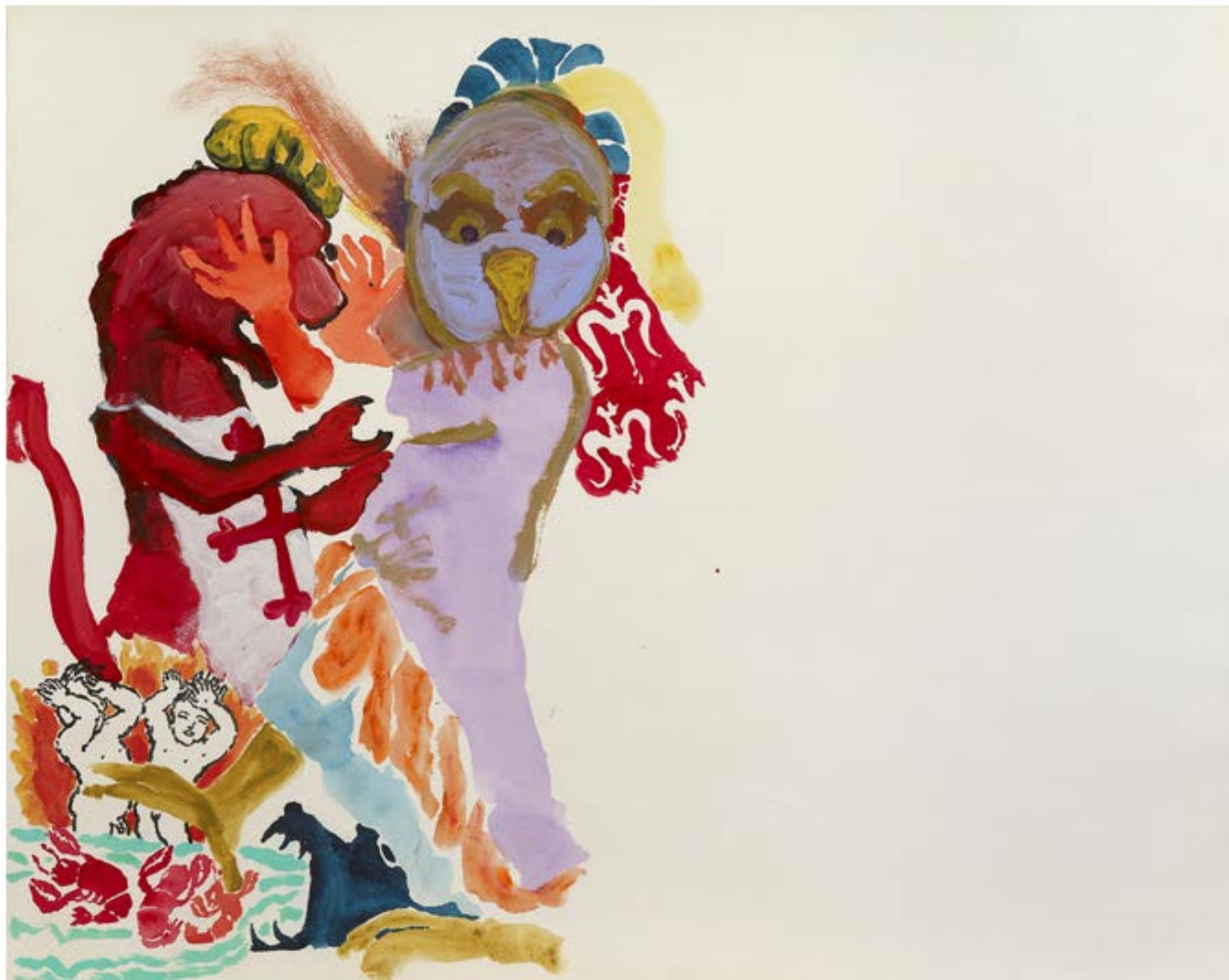
London's Marlborough Fine Art will offer Paula Rego's Cruzada (Crusade), 1983.

Share 64 Tweet 22 Pinterest 1 sharethis 87