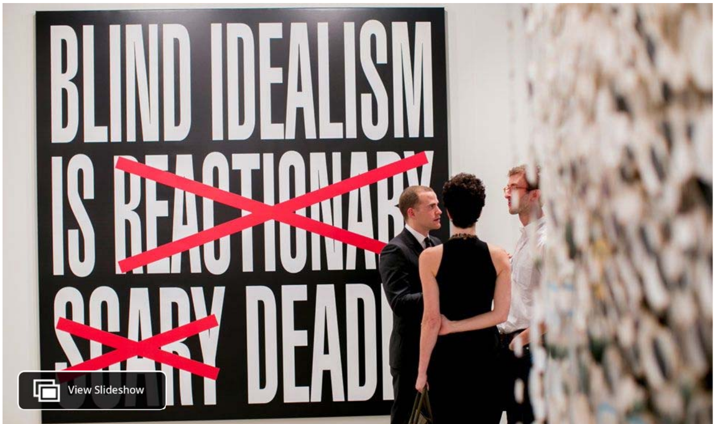
Barbara Kruger's "Untitled (Blind Idealism is Deadly)" 2013 on view at Art Basel Miami Beach.