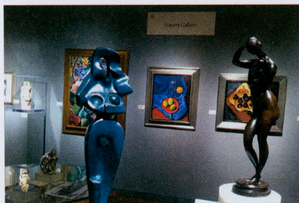
The Forum Gallery booth at The American Art Fair .