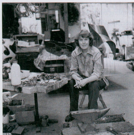
Claire Falkenstein in her Venice, California, studio in 1975.