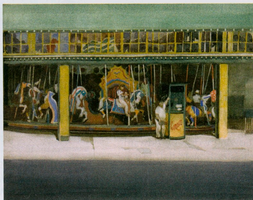
David Levine (1926–2009), Carousel , 1989. Watercolor on paper, 11 \frac{3}{8} x 14 \frac{1}{4} in. ©Estate of David Levine. Courtesy Forum Gallery, New York.

David Levine: The World He Saw will focus mostly on Levine's watercolor landscapes, especially those of Coney Island—Levine was from Brooklyn—and also on his figurative work, many of them of garment workers. The exhibition features five decades of paintings and drawing. The show, which opened December 12, 2014, runs through January 17.